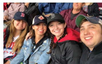
Fun at Fenway Park "GO SOX"